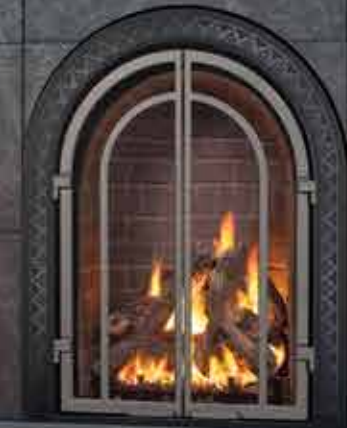
M27 Chelsea with Premium Fiber Oak Log Set, Antique Red Firebrick Liner, Ashton Black Front, Vintage Iron Filigree Overlay, and Vintage Iron Metal Doors