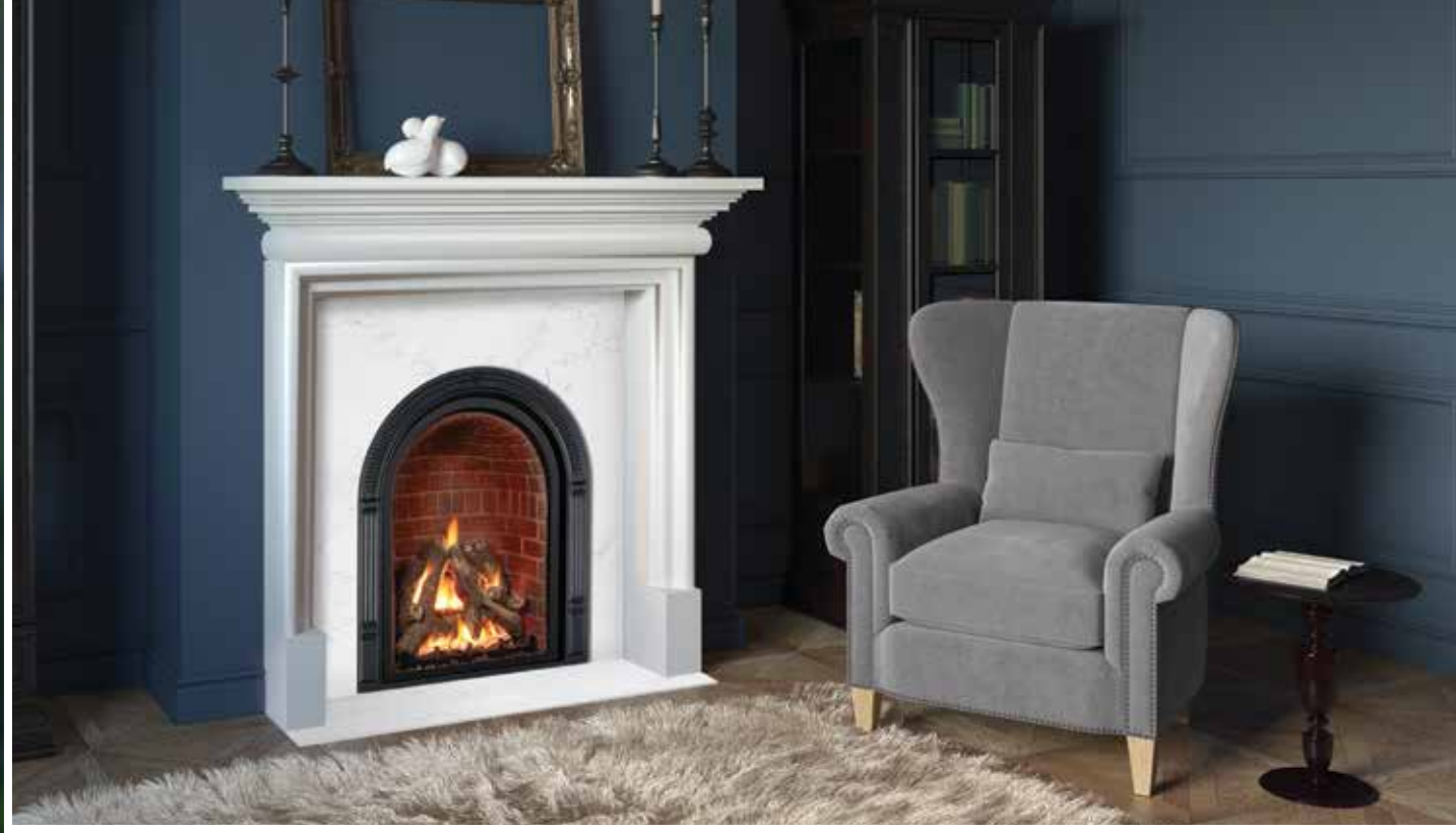
M27 Chelsea with Premium Fiber Oak Log Set, Antique Red Firebrick Liner, and Hanover Cast Iron Front