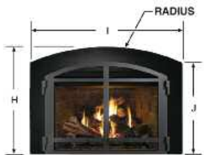
Shown with Andover doors in Black